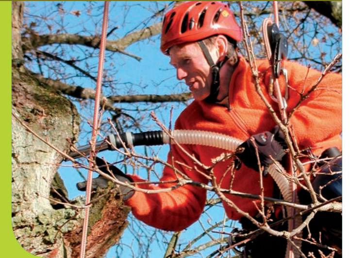
■ We are developing new methods for mapping important animal species for Natura 2000. A mould aspirator helps us to detect rare beetles in tree cavities.