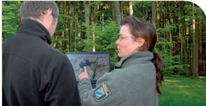
■ We are developing climate risk maps for tomorrow's forest, and, in doing so, we are creating an important foundation for forward-looking forest consulting.